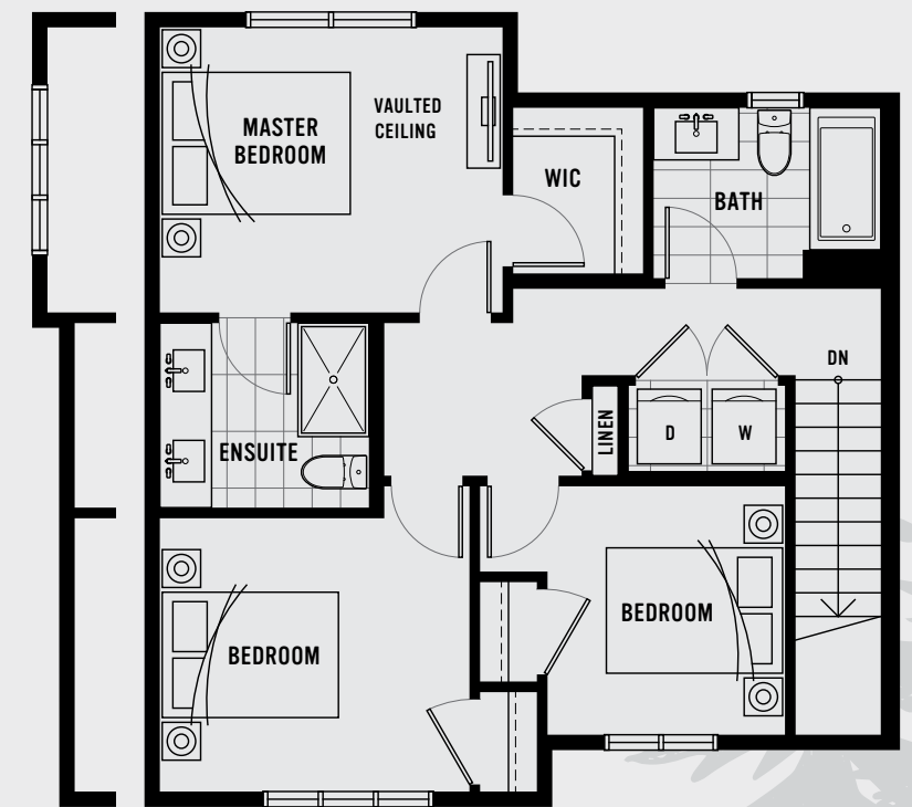
A1 VARIATION A